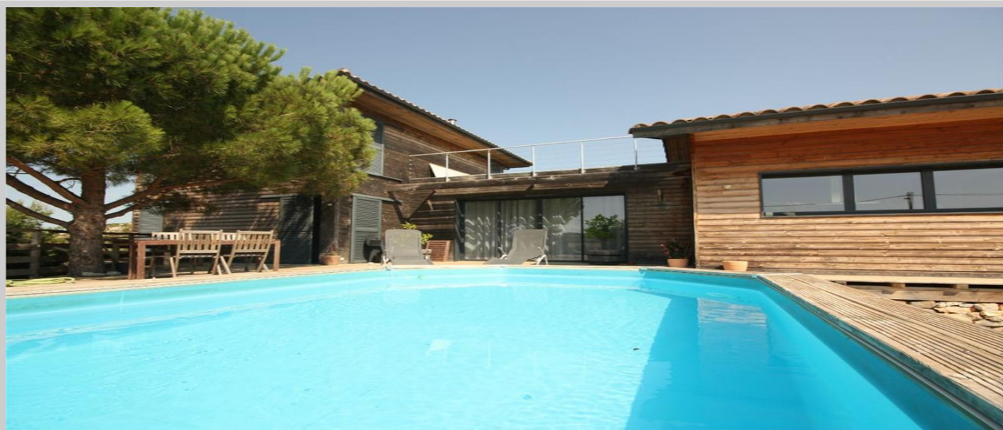
SUPERB BIOCLIMATIC DETACHED VILLA WITH POOL AND VIEW, VINGRAU