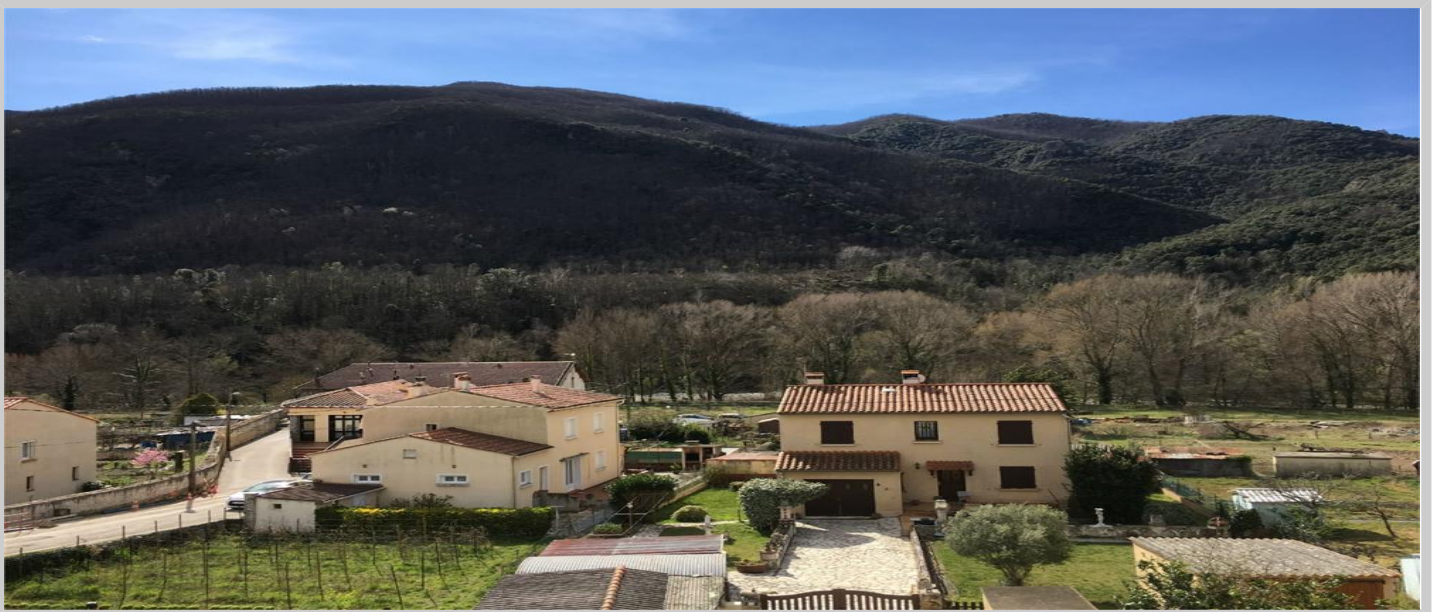
VILLAGE HOUSE WITH GARDEN, ARLES-SUR-TECH