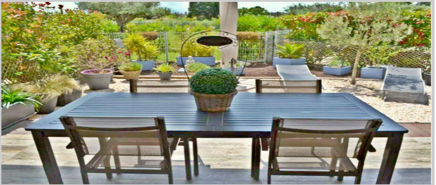
SEMI-DETACHED VILLA WITH GARDEN, TERRACES AND GARAGE, STE MARIE